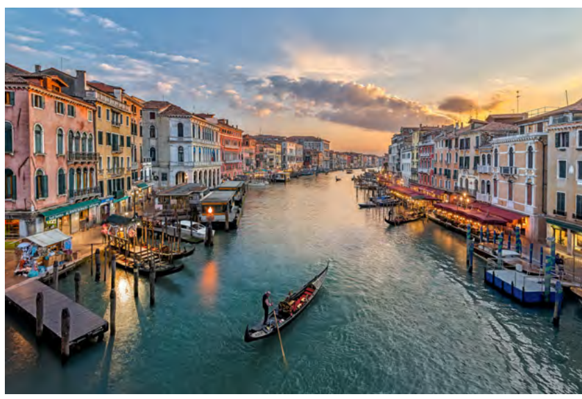
20 July saturday

// Departure or Add on experience in Venice (price 99 euros)